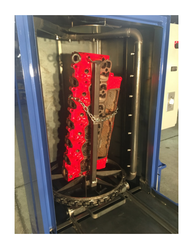
The Terminator $W2432 includes a clear 32" vertical height and a 24" rollout diameter turntable. $W2432 model shown with 5.9L Cummins

The new Terminator series is equipped with a 24" diameter turntable and a choice of a 32" or 44" vertical capacity. This all new exclusive design is powered by a 5 hp pump, gear driven rollout turntable, and a built in hot tank.