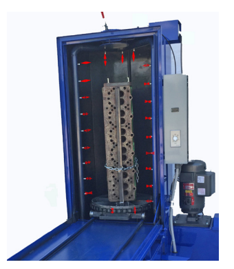
360 degree spraychamber

Gear driven turntable with spring loaded safety clutch engages in turntable that guarantees consistent turntable rotation within the spraychamber for a complete cleaning job.