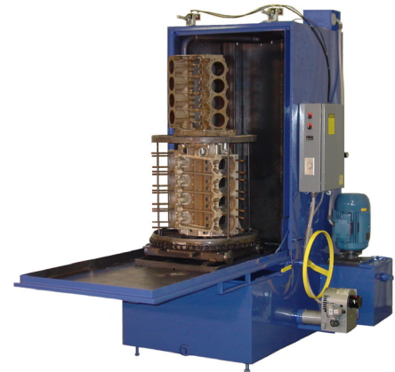
2 blocks per wash cycle

The Ultimate SW-50 is an ideal machine for rebuilders that offer heavy duty and light duty services. The SW-50 spray chamber measures a full 50" vertically with a wide 28" diameter turntable and a beefy 1500 pound weight capacity. The SW-50 is powered by a large 10 HP Motor flowing 140 gallons per minute at 80 psi of hot cleaning solutions making for fast and efficient cleaning. This versatile machine will accommodate blocks such as the Caterpillar C5 and 3406E models, Cummins ISX, 60 series Detroit, and many more. The SW-50 with its exclusive fixturing can also clean two automotive blocks per wash cycle, or one automotive block with all its sheet metal parts per wash cycle. This unique stacking feature takes full advantage of the 50" height. The SW-50 also features a built in hot tank for added cleaning performance. Like all AXE Spraywashers the SW-50 incorporate a spring loaded lay down door for ease of loading and unloading and for maintaining a much cleaner and drier shop floor.