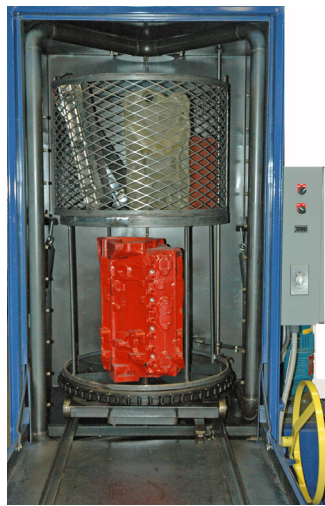
1 blocks with sheetmetal per wash cycle