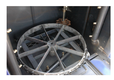
Gear driven turntable with spring loaded safety clutch guarantees consistent turntable rotation within the spraychamber for a complete cleaning job.

The AXE Eliminator SW-20 Combination Spraywasher/Hot Tank is packed with plenty of cleaning power. The 32" vertical capacity and 20" diameter roll out turntable will accommodate most passenger and light truck applications, including straight six and big blocks. The Eliminator has two built in hot tank sizes available. The SW-20-OS Model has a 12" x 24" x 11" hot tank size and the SW-20-HT Model has a 21" x 30" x 11" hot tank size. This unique design offers additional cleaning features and it makes cleanout easy with its wide open reservoirs. Both Models are available in gas or electric heat.